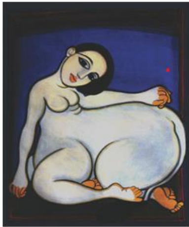
Fig.8 Kamdhenu

questioned the situation of a woman through this series of her work. In Kamdhenu, she has taken the myth of Kamdhenu and then represented it to spread awareness regarding social inequality towards women. In this way, the animal imagery has been equipped by the artist to criticize the duality of societal construction, where a woman is often neglected from their self-exploration and identity. These mythological perceptions are often used for the direction of social code of conduct for the marginalization of women because women are expected to serve the society to satisfy those politicized icons and her will has no value for these gender-bias norms. As stated by Pal 'the kamadhenu (cow Goddess) is a dominating phenomenon for all Indian women Indians according to mythology, the Kamadhenu would grant its owners all their wishes without demanding anything in return, and her wish does not matter to anyone'. (G.S. Pal, Personal communication, 21 May 2015)