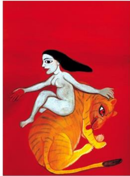
Fig-5 Hat-Yogini Shakti

Fig.4