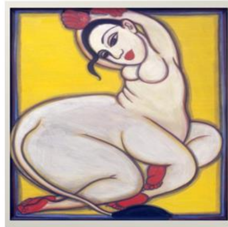
Fig. 9 Kamdhenu