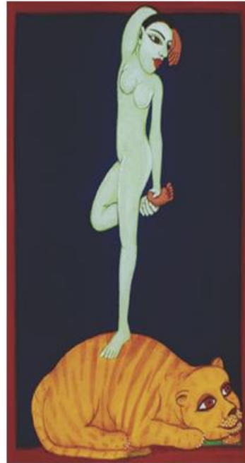
Fig. 2 Yoginis of 64 Yogini temple at Orissa Fig. 3 Hat-Yogini Shakti, Credit Gogi Saroj Pal