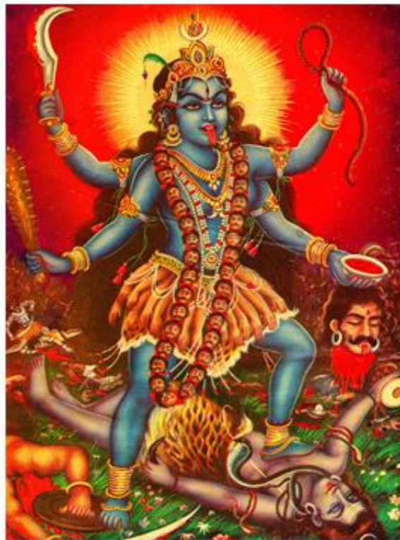
Fig.4 Goddess Kali on Shiva

If it is compared with the stereotype of a previous Yogini figure, there can be numerous aspects, which differentiate them from each other. Pal has avoided the beauty and ornamentation and replaced the ferocious tiger with the decent one. It is also observed that the protagonist of the Hat-Yogini Shakti series is not related to any mythical story, they belong to the woman of the contemporary era, they are getting victory over the difficulties at their own will. She is not born for the philanthropic purpose like fighting for others or doing battles for other's sake, she is busy in herself, she is invented for the realm of an earthly woman- not for Godly woman, she is a simple creature in herself, and her tiger is like her, very relaxed with its calm gesture.