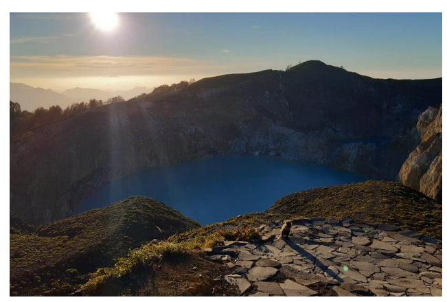
Figure 1 Kelimutu Lake

Kelimutu National Park area is located in Ende Regency, East Nusa Tenggara Province, has an area of 5356.50 ha, bordering 24 villages in 5 subdistricts in Ende Regency (Taman Nasional Kelimutu, 2020). In this area there are several mountains, including Mount Kelibara and Mount Kelimutu which is the location of Lake Kelimutu known as Three Colour Lake and was once designated as one of the 9 wonders of the world (Ardiansyah, 2017).