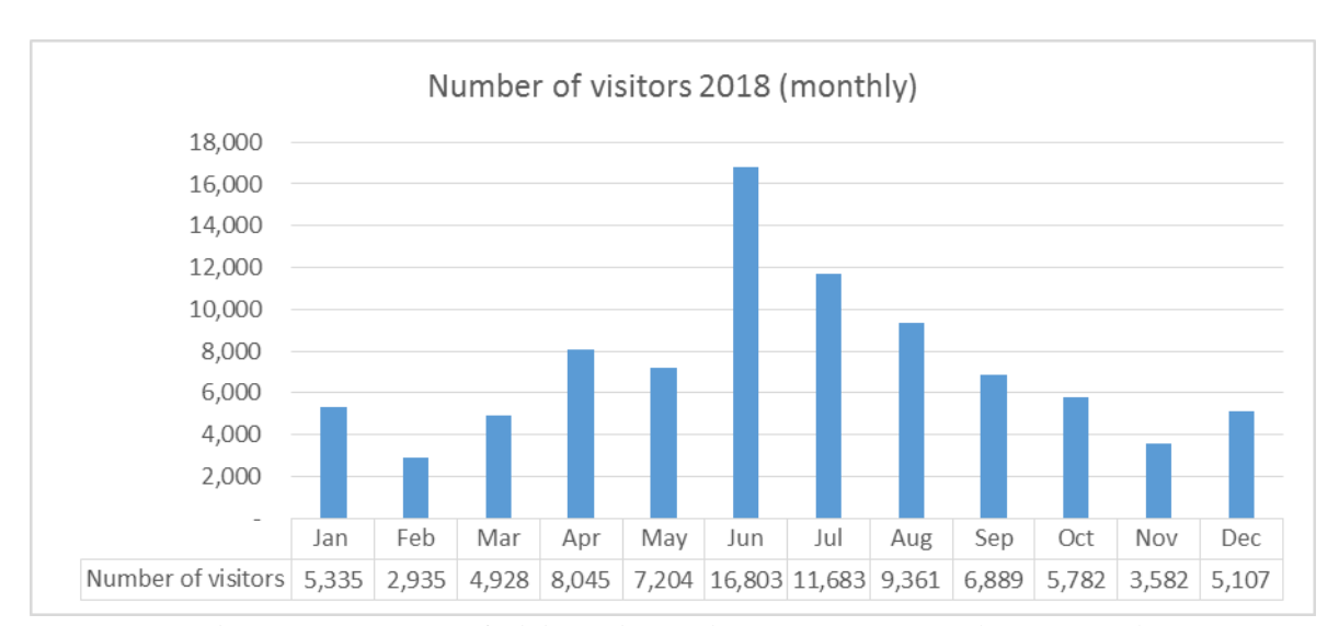
Figure 3 Number of visitors in Kelimutu Lake 2018 (per month)

From the data above, number of visitors increased in 2017 then decreased by 3.9% in 2018. In 2018 visitors increased in the middle of the year but decreased at the end of the year, the data can be seen in the following graph: